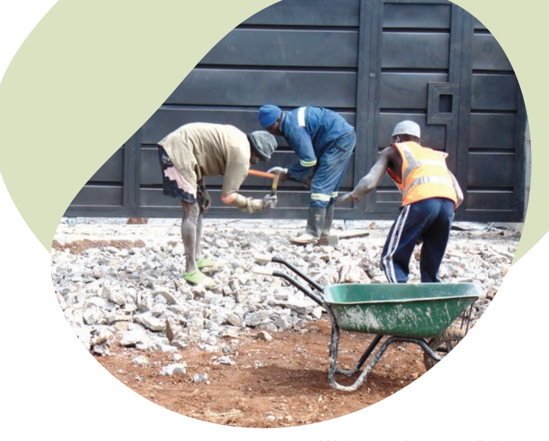
Wider gates being installed at the new premises and preparing for a concrete ramp

The response we received from this appeal was overwhelming. Without your help we would have faced significant challenges. On behalf of Vwila and Workaid, we would like to say a huge thank you to everyone who donated to this appeal.